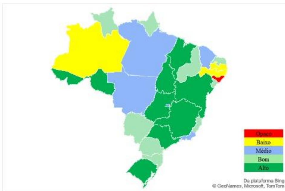
Figure 3. Transparency of the vaccination data for the states - ITVC-19 (sixth survey)

As one may observe in Figure 3, upon the closing of this study, all ITVC-19 levels were identified in the country, being distributed by the regions as follows: the opaque level was only verified in the Northeast Region (AL); the low level, in the Northeast (PE and PB) and North (AM); the intermediate level, in the Northeast (CE), Central-West (MT), North (PA), and Southeast (RJ); the good level, in the Northeast (PI, RN, and SE), Central-West (DF and MS), North (AP and RR), Southeast (ES), and South (PR and SC); the high level, in the Northeast (MA and BA), Central-West (TO and GO), North (RO and AC), Southeast (MG and SP), and South (RS). The most positive distinctions were Acre and Rio Grande do Sul, which obtained the maximum score (100) from the second to the sixth surveys; Alagoas stood out negatively since it figured at the low level in one of the surveys and at the opaque level in the other five. This scenario, in which only two states obtained the maximum score for the ITVC-19, agrees with the findings by Pinho et al. (2020) because it made evident that transparency is a challenge for the country, given that the desirable data about the transparency process of the vaccination in the country were not available and/or open to the public.